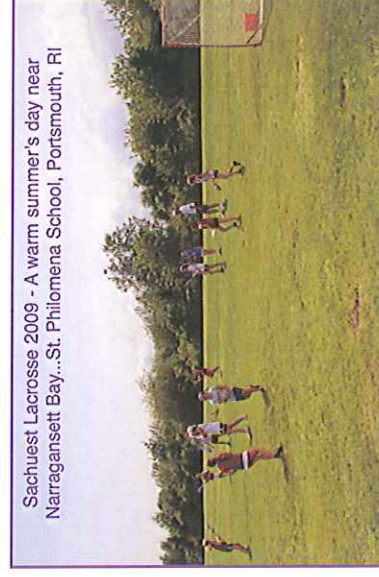
Sachuest Lacrosse 2009 - A warm summer's day near Narragansett Bay...St. Philomena School, Portsmouth, RI

"The Draw" That frozen motionless moment, whose stillness turns to a symphony of heroic effort, a moment for all, a time for the ball, my ball!!